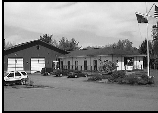
LCATV Offices Prim Road – Colchester, Vermont