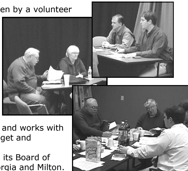
LCATV Board of Directors

LCATV currently has two vacancies on its Board of Directors: the Public Access seats for Georgia and Milton. Anyone interested in these seats can contact the Executive Director at 862-5724 or info@lcatv.org .